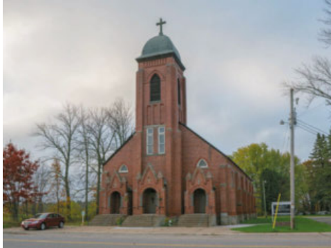
Mill Creek, WI