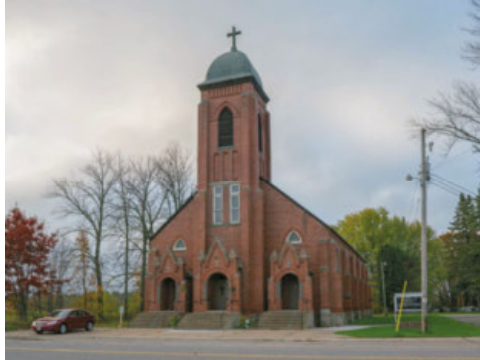
Mill Creek, WI