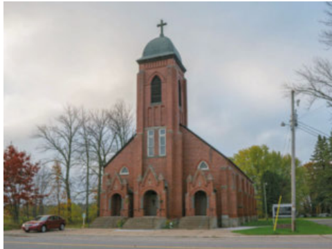
Mill Creek, WI