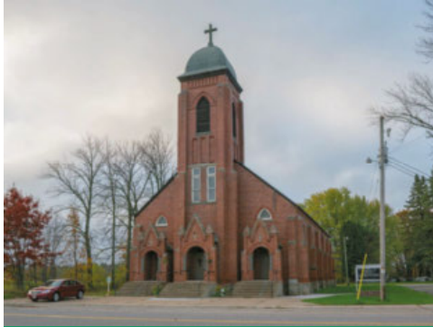
Mill Creek, WI