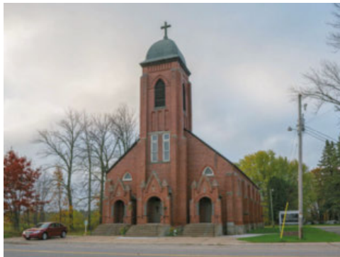
Mill Creek, WI