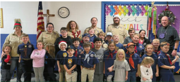
Thanks for visiting us at our Christmas Party!

Please make checks payable to Catholic Services Appeal.