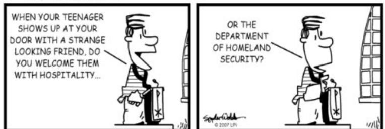
16th SUNDAY IN ORDINARY TIME