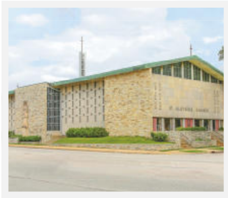
92ND STREET SITE 1405 S. 92nd Street