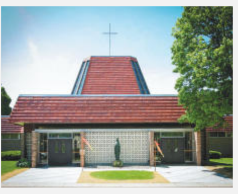
106TH STREET SITE 2322 S. 106th Street