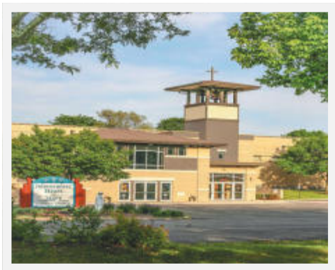
116TH STREET SITE 1212 S. 117th Street