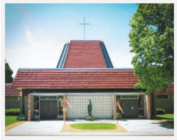
106TH STREET SITE 2322 S. 106th Street