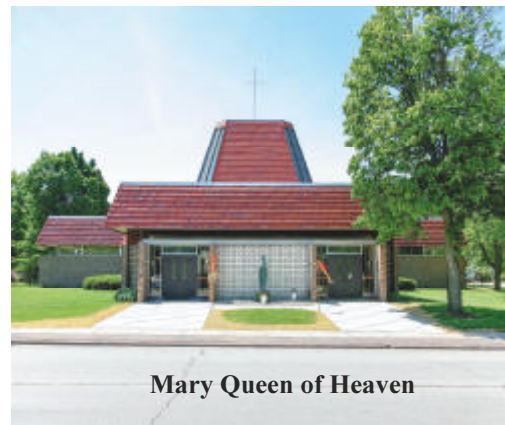
Mary Queen of Heaven