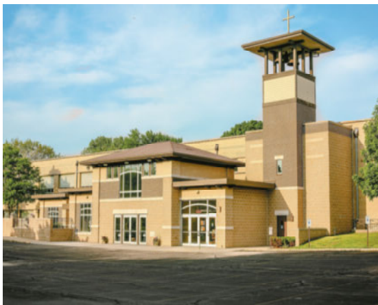
MPH WEST 1212 S. 117th Street