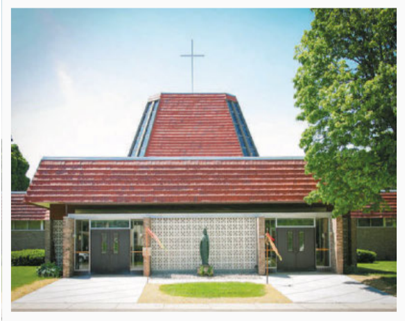
MPH EAST 2322 S. 106th Street