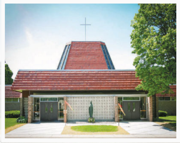
MPH EAST 2322 S. 106th Street