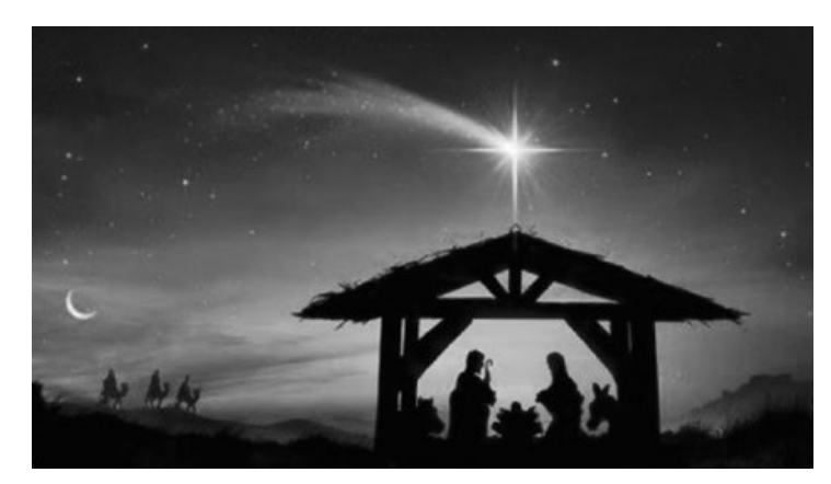
Arch Indy Black Catholic Ministry How is our Neighborhood Better because Our Parish Is Here?