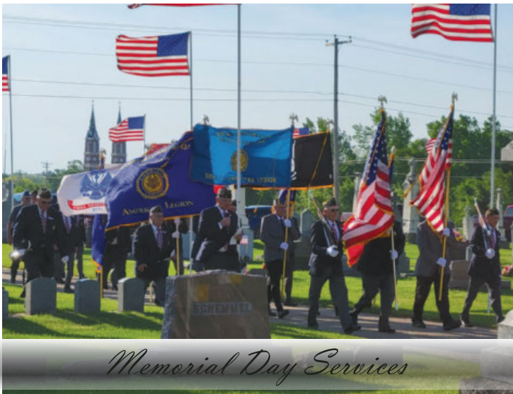
Memorial Day Services

FORMED ~ Free online resource for all parishioners, FORMED offers a lot of different Catholic programs, movies, books, and talks, designed to be accessible anywhere at any time (on smartphones, tablets and computers). There is content for all ages, including Spanish content! Start a group or a Bible study, and watch any number of catechetical videos provided through this website. It's that easy and it's FREE. Visit our Spires of Faith website and under Faith Formation go to Adult Faith Formation.