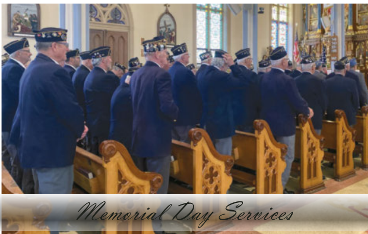
Memorial Day Services