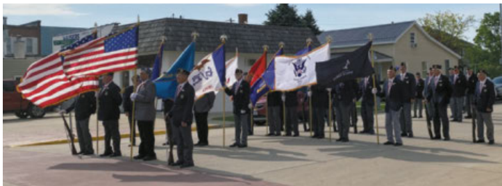
Memorial Day Services