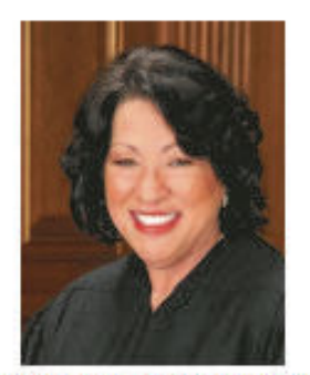
Justice Sonia Sotomayor