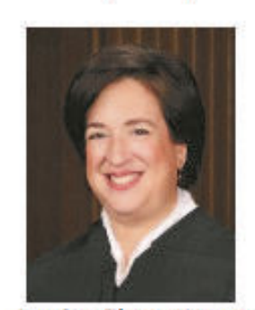
Justice Elena Kagan