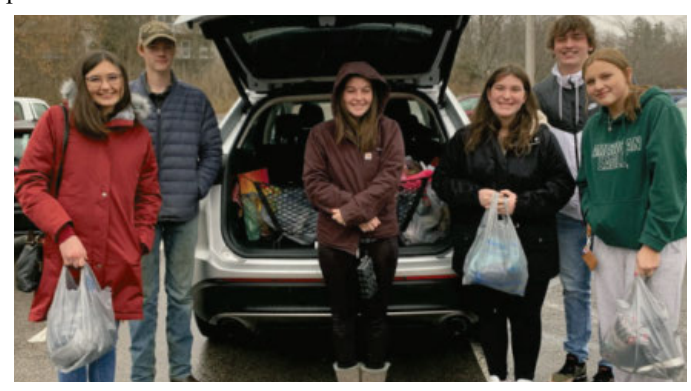
Confirmation students shop for gifts to donate to The Sharing Center