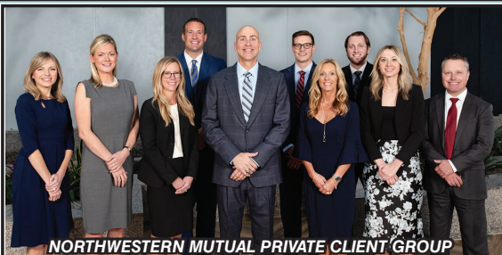
NORTHWESTERN MUTUAL PRIVATE CLIENT GROUP