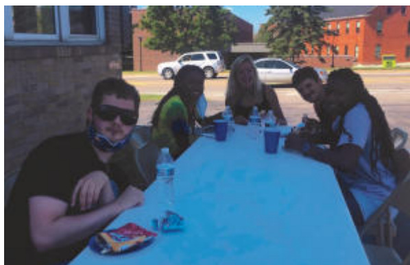
The Fall Kick-Off Begins!