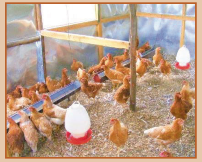
Greenhouse project at DePaul Centre, Nairobi