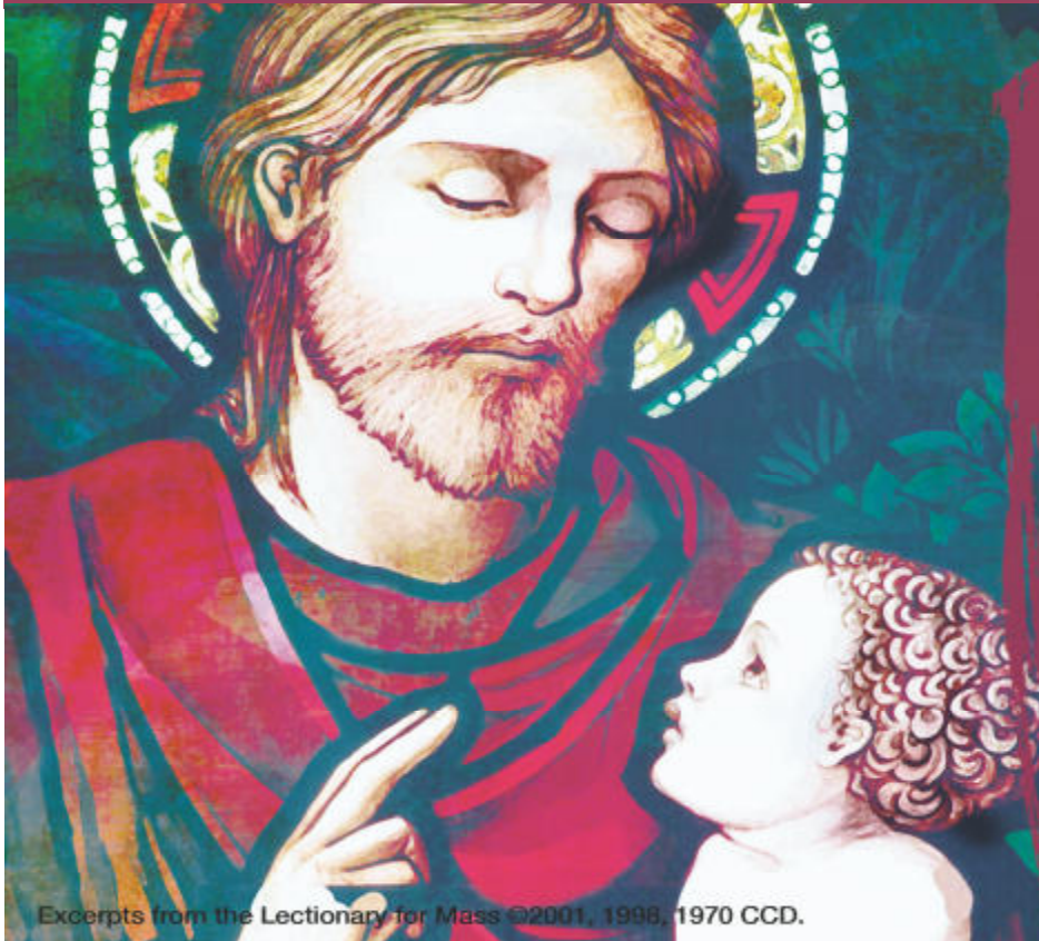
Excerpts from the Lectionary for Mass ©2001, 1998, 1970 CCD.