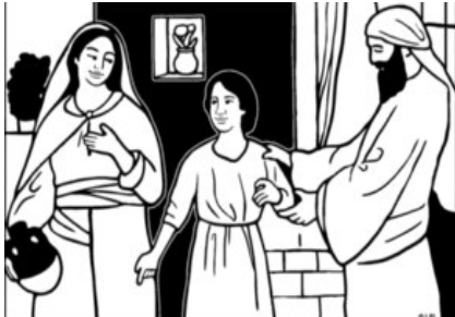
Epiphany of the Lord