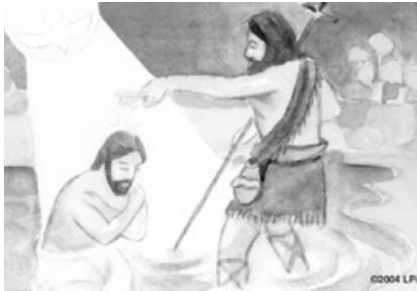
Baptism of the Lord

Jesus, whom God called “my beloved Son,” is also the “servant” of whom Isaiah speaks in the first reading. We who are baptized in Christ must follow His example and use our time and resources in the service of God and neighbor.