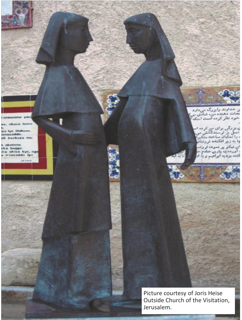
Outside Church of the Visitation, Jerusalem.

When Elizabeth heard Mary's greeting, the infant leaped in her womb, and Elizabeth, filled with the Holy Spirit, cried out in a loud voice and said, "Blessed are you among women, and blessed is the fruit of your womb." — LK 1:41-42