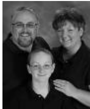
Family Photo Parish Directory - 2011