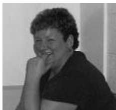
Supervising Swimming 2010