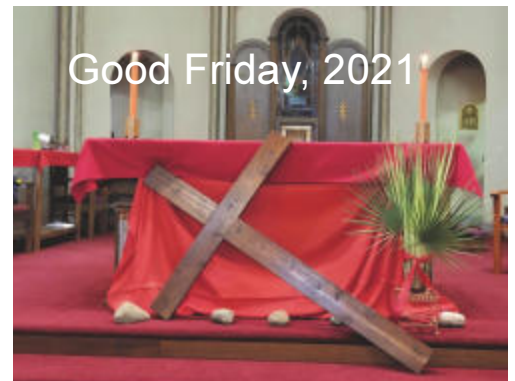
Good Friday, 2021