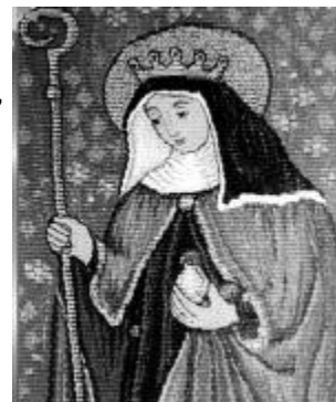
St. Walburga, with the crozier of an abbess and a vial of holy oil.

Walburga died on February 25, 777 or 779 (the records are unclear) and was buried at Heidenheim. Christians still make religious pilgrimages to her tomb, which to this day produces a holy oil known as St. Walburga's oil, said to heal sickness; Benedictine nuns distribute this oil in vials to Christian pilgrims who visit the tomb. She is invoked for protection plague, rabies and whooping cough, as well as against witchcraft. Walburga was canonized in 870 by Pope Adrian II; her feast day is February 25.