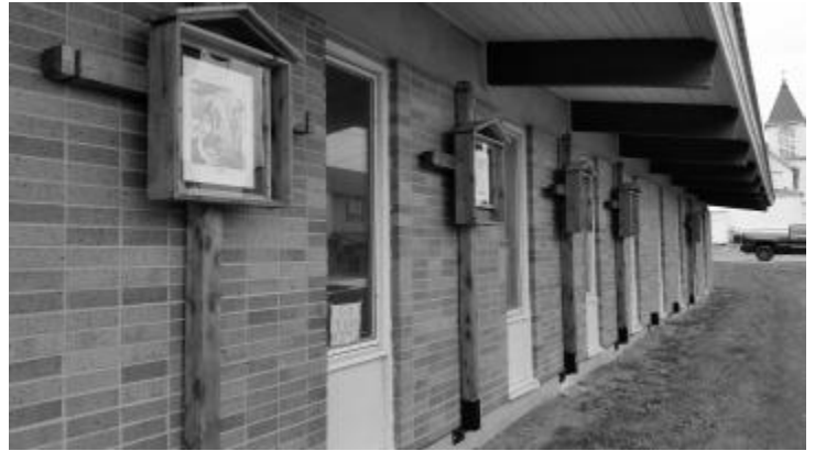
The Stations are in place! Plan to attend their blessing on September 14.

The Ridgeway/Barneveld 10905 Knights of Columbus Council will hold its monthly meeting on Tuesday, Aug. 27 at 7 p.m. at Immaculate Conception Church in Barneveld. All members and those interested in joining are welcome.