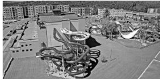
No time for the water park.

Sunday afternoon I head to Wisconsin Dells for the annual clerical convocation of our diocese. Although we will be meeting once again at the Chula Vista resort hotel, our schedule, alas, allows little time to frolic in the water park. I expect to be back on Wednesday afternoon. Mass on Tuesday and Wednesday morning will therefore have to be cancelled, to resume on Thursday morning. If any matter of pastoral urgency arises, I can be reached by e-mail or at 608-425-9531.