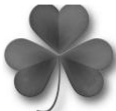
The shamrock, sometimes proposed as an illustration of the Trinity.

No doubt about it, the Trinity is at the heart of the faith! It’s all the stranger, therefore, to reflect that among the myriads of popular devotions our faith has inspired, there are precious few devoted to the Trinity. The Raccolta , a pre-Vatican