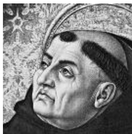
St. Thomas Aquinas

Patriotism is a Christian virtue. But how so? We are grateful for American freedom and prosperity, but St. Thomas Aquinas, the Church's greatest theologian (or at least the peer of St. Augustine as the Church's greatest theologian), understands patriotism in a distinctly theological sense: Love of country, he says, is an aspect of the virtue of piety . He discusses it in the same section as honoring our parents. You begin to see the connection when you consider the relation between the Latin words patria or country and pater — father or parent.