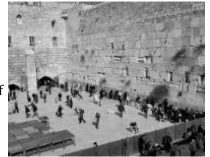
The Western Wall of the temple mount in Jerusalem. Note that this was not a wall of the temple itself. It is part of the retaining wall supporting the ground on which the temple was sited.

Constantinople fell to the Moslems in 1453. They confiscated Hagia Sophia and made it into a mosque, which it remained until a secular Turkish government repurposed it as a museum in 1935. On Friday July 24, the current Islamist-influenced government of Turkey reconverted it to a mosque, which is to say they desecrated it afresh. The United States Conference of Catholic Bishops along with the Greek Orthodox Archdiocese of North America called on the faithful to mark the 24 th as a day of mourning. I personally experienced it as a day of loss, and I suspect many Orthodox experienced it as reopening a wound that had never fully healed.