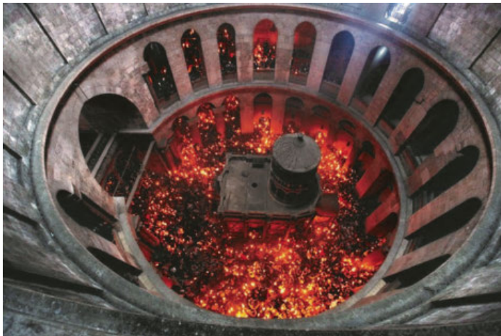
The Light of Christ: The New Fire is borne by worshipers surrounding the "Edicule," which enshrines the tomb of Jesus in the Basilica of the Holy Sepulchre, Jerusalem

Christ is risen! He has burst open the gates of hell and let the dead go free; he has renewed the earth through the members of his Church now born again in baptism, and has made it blossom afresh with men brought back to life. His Holy Spirit has unlocked the doors of heaven, which stand wide open to receive those who rise up from the earth. Because of Christ's resurrection the thief ascends to paradise, the bodies of the blessed enter the holy city, and the dead are restored to the company of the living. There is an upward movement in the whole of creation, each element raising itself to something higher.