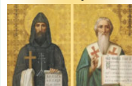
Saints Cyril and Methodius