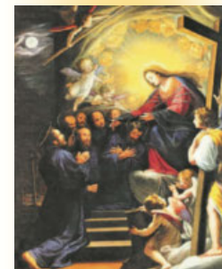
The Seven Holy Founders of the Servite Order