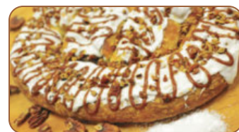
Uncle Mike's Bake Shoppe