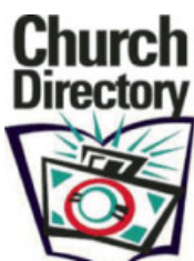
Photo Directory Update