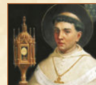
Saint Norbert June 6