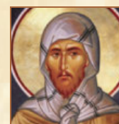
Saint Ephrem June 9