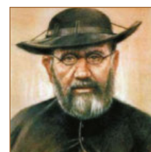
St. Damien of Molokai