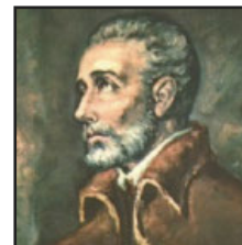
St. John of Avila