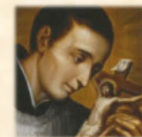
St. Aloysius Gonzaga