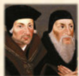
Sts. John Fisher and Thomas More