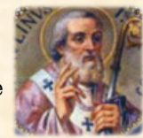
St. Paulinus of Nola