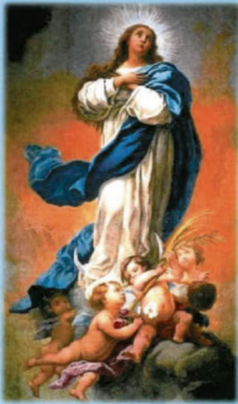
Patron Saint of Our Country The Immaculate Conception

O Most Blessed Virgin Mary, Mother of Mercy, at this most critical time, we entrust the United States of America to your loving care.