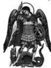
Saint Michael Prayer

Saint Michael the Archangel, defend us in battle, be our defense against the wickedness and snares of the devil. May God rebuke him, we humbly pray; and do thou, O Prince of the heavenly host, by the power of God, thrust into Hell Satan, and the other evil spirits who prowl about the world for the ruin of souls.