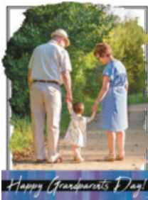
Happy Grandparents Day!

If you would like to join this wonderful group of women feel free to reach out to the office for more information.