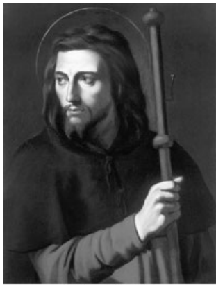
James the Great (anon)

Thank you to the person that brought the box of free word find books. We took the extras that were left after a few weeks to keep for the elderly gift bags that get distributed at Christmas time.