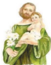
ST. JOSEPH NOVENA