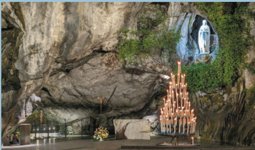
The Lourdes grotto at night