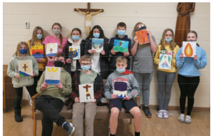
Our Faith Formation middle school students show off their paintings of their interpretation of the Holy Spirit. The pictures are beautiful—just like the students who created them!