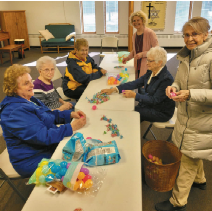
Over 100 packages of Easter gifts and treats were donated by generous St. Paul parishioners! Special thanks to Christian Services for organizing and delivering the many gift bags. Thanks to our parish, over one hundred children in local Fox Valley shelters will receive Easter gifts. Thank you! The ladies of Christian Services also prepared 500 eggs, each filled with chocolate treats and a Bible verse. The eggs will be distributed to everyone at all the Easter Masses this weekend.