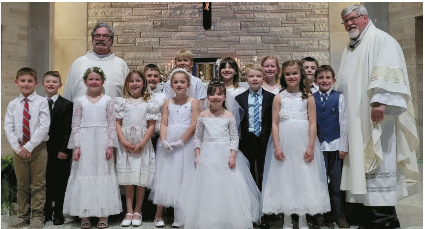
Congratulations to our fourteen First Communicants who received Jesus for the first time in the Eucharist on May 1, 2022. God Bless these children and their families.