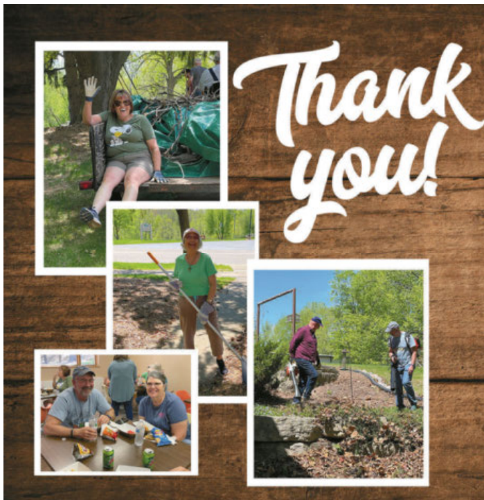
Last Sunday, parishioners and staff gathered to clear leaves, sticks, and debris from the area surrounding the Parish Center and the Our Lady of Grace Shrine. What a huge difference they made! We are so grateful to everyone involved in the cleanup. Our grounds are attractive and reflect the beauty of our Parish family. Thank you!