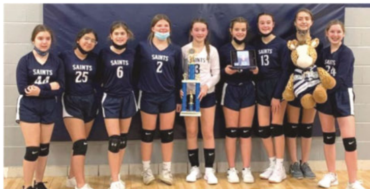
Congrats to our Lady Saints! TCA 7th grade volleyball team 2nd place winner in the Volleyball Winter Classic.