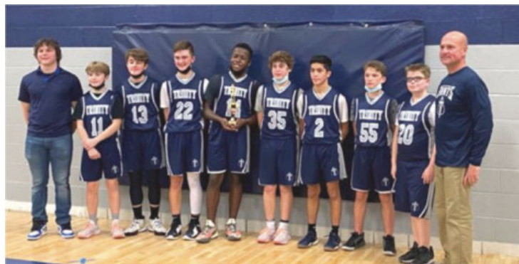
Congratulations to our TCA 8th grade boy's basketball team and coaches...your school family is so very proud of you!! Prairie Conference 2nd place