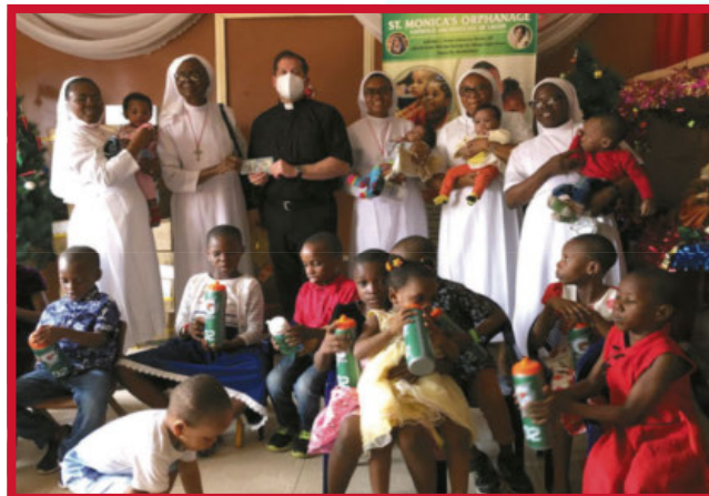
Presentation of $2,500 gift at St. Monica's Orphanage, Lagos Nigeria