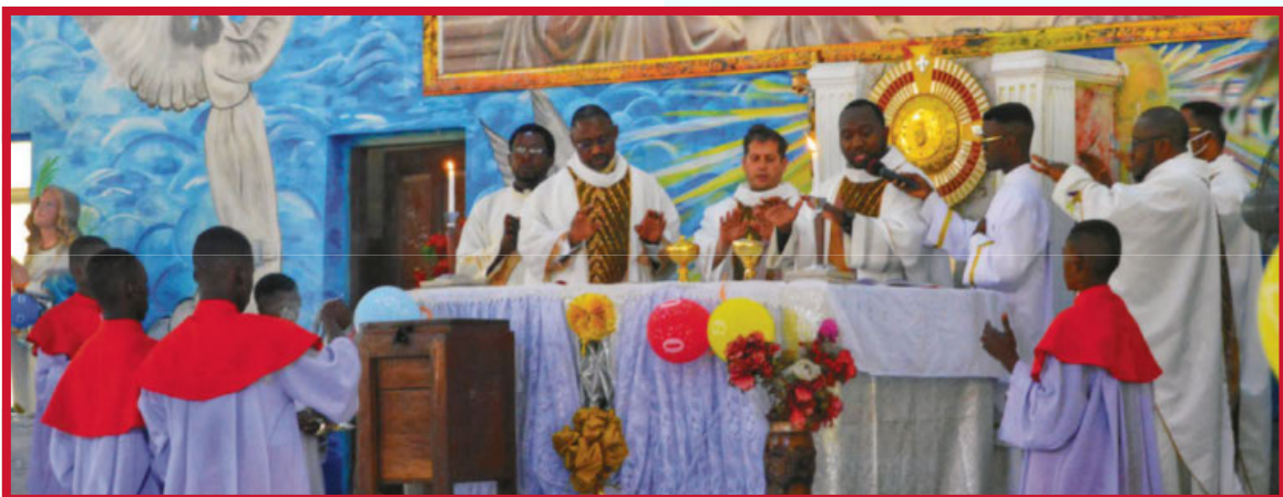
Mass of Thanksgiving at Saints Peter and Paul Parish, Owerri Nigeria