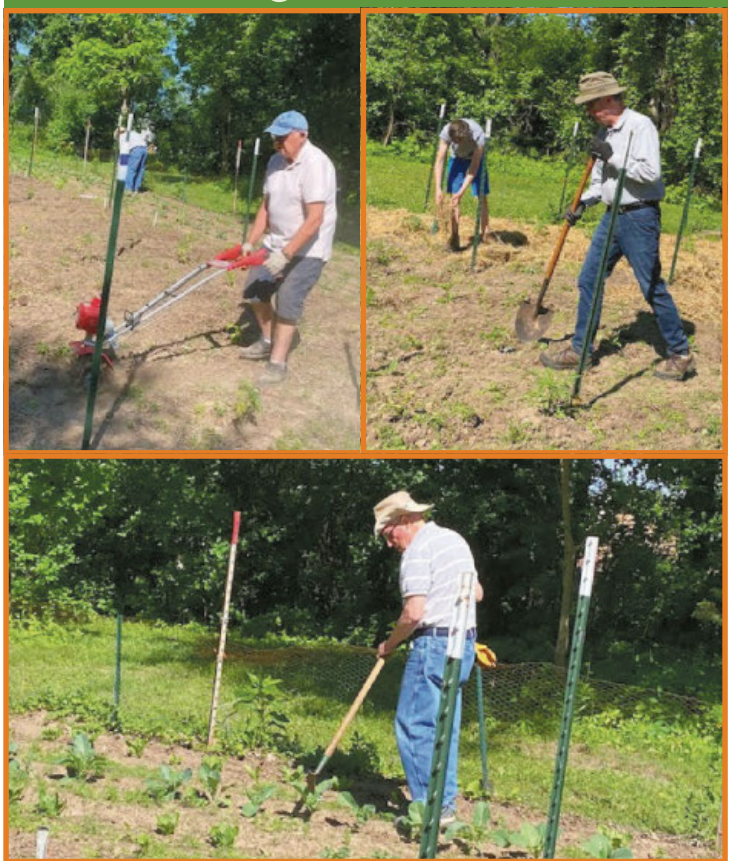
Several parishioners team up to work in a small garden in back of church, producing some wonderful fresh veggies. The bulk of the produce is divided based on the amount grown and shared with the following Food Pantry's: Lussier Food Pantry, Green County Food Pantry, Middleton Outreach Ministry Food Pantry, Verona Area Food Pantry