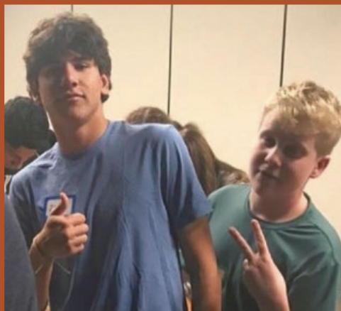
Scenes from High School Youth Pumpkin Carving on October 23rd